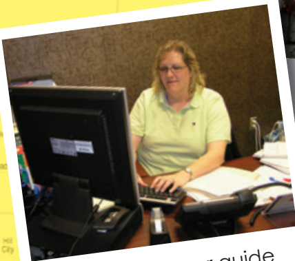
teacher answer guide