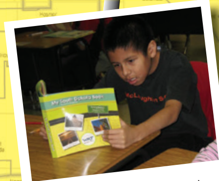
My South Dakota Book